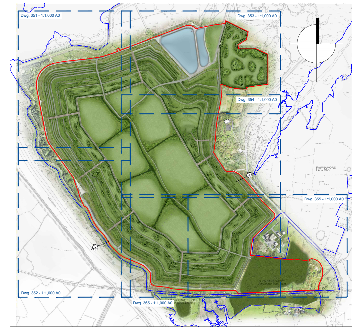
KEY PLAN Scale N.T.S