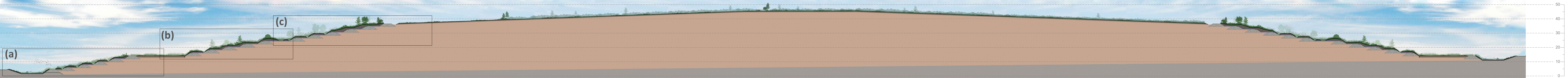
KEY SECTION 1-1 1:1000

For Outline Planting Specification refer to drawing 6368_350 'Landscape Masterplan'